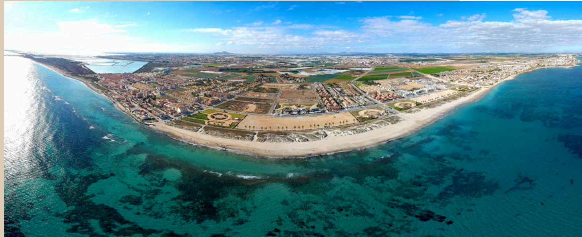
Las higuercas Beach