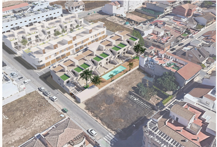
Playamar XI view of the plot

The coastline of Pilar de la Horadada stretches for more than 4 kilometres and boasts extensive beaches of fine white sand in intense contrast to the small and private, sheltered coves. At Pilar de la Horadada you can enjoy more than 320 days of sunshine per year, so you can learn about its history, festivals, traditions and culinary wealth, or practice all sorts of sports in its modern facilities.